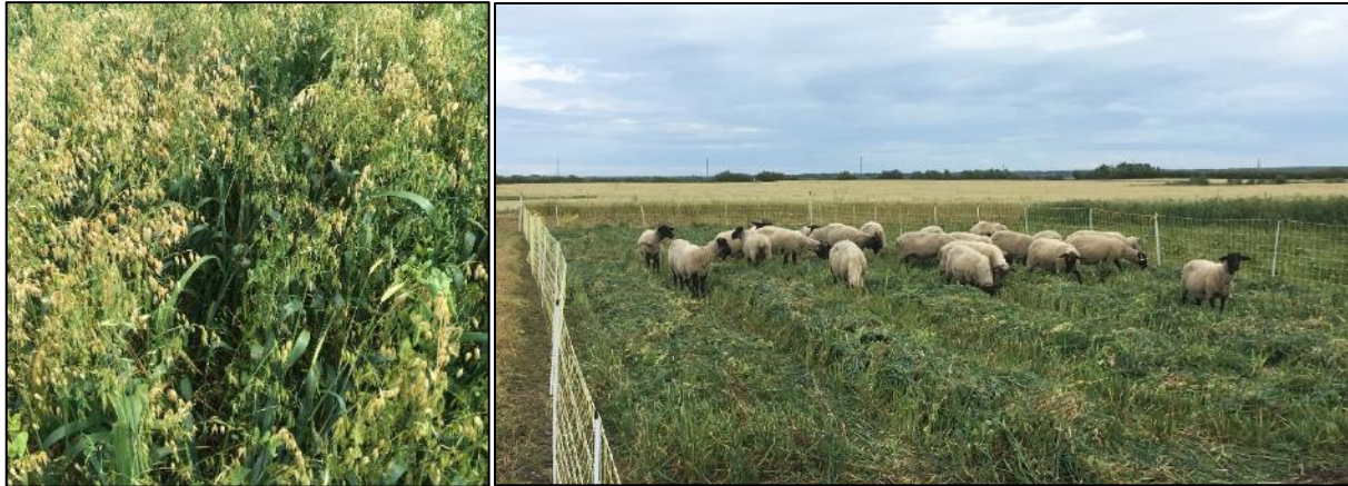
Figure 1: (a) green manure before grazing; (b) sheep on swathed green manure.