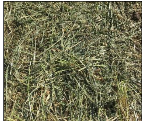
Figure 2: Green manure after grazing

* Developed by Elisabeth Nernberg (ARD).