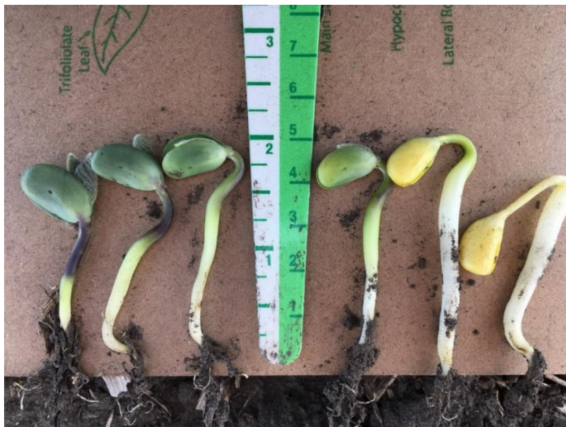
Figure 3. Soybean seedlings emerging from 0.5 to 2.25" seed depth (L-R), 7 days after seeding on May 24, 2017. As depth increases, emergence is slower and vigour is reduced.

Based on the first 2 years of study, farmers should choose seeding depths between 0.5 and 1.5 inches depending on their soil type, management practices, equipment and rain forecast. Measuring seed depth during seeding and adjustments by field may be necessary. A post-emergent assessment to measure actual seeding depth at the cotyledon or unifoliate stage should be incorporated to ensure that the target seeding depth was achieved.